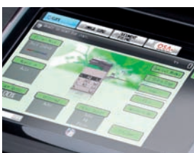
7.0 inch LCD colour touch screen.

A 7.0 inch touch screen colour LCD with thumbnail previews and convenient stylus pen, for example, makes everyday operation simple and intuitive. We've even added easy-grip handles to the paper drawers.